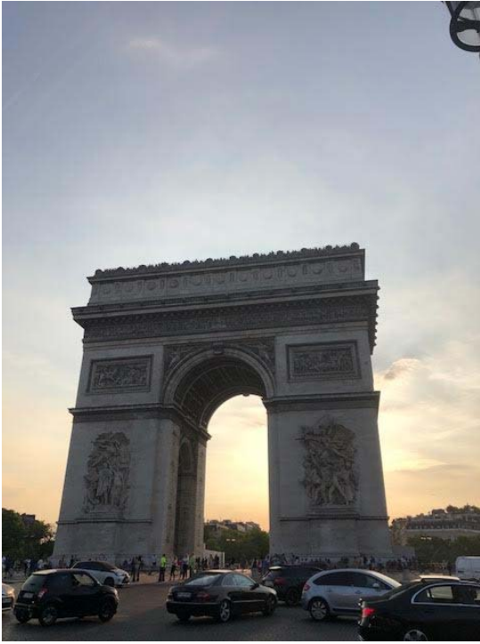
Arc de Triomphe