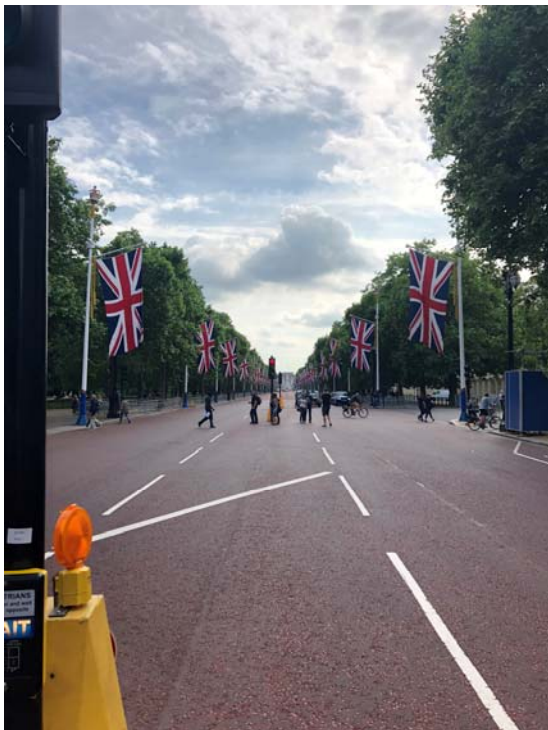
Road to Westminster Palace