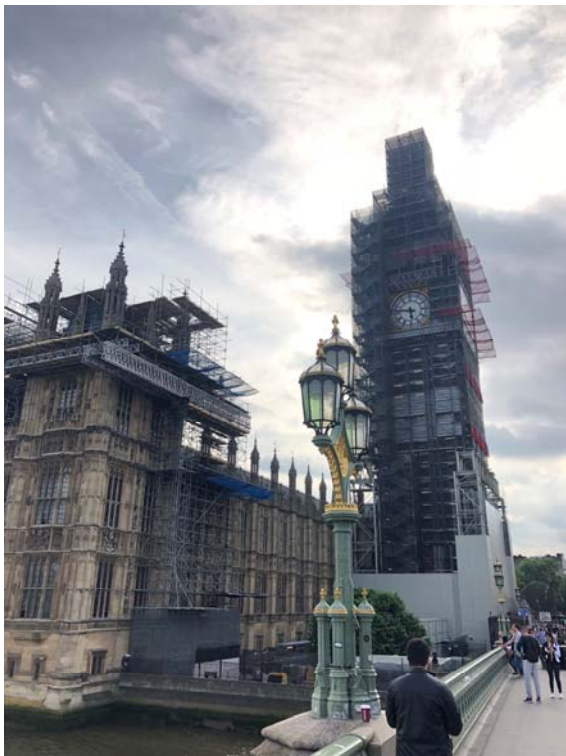
Big Ben (unfortunately it is currently being restored)