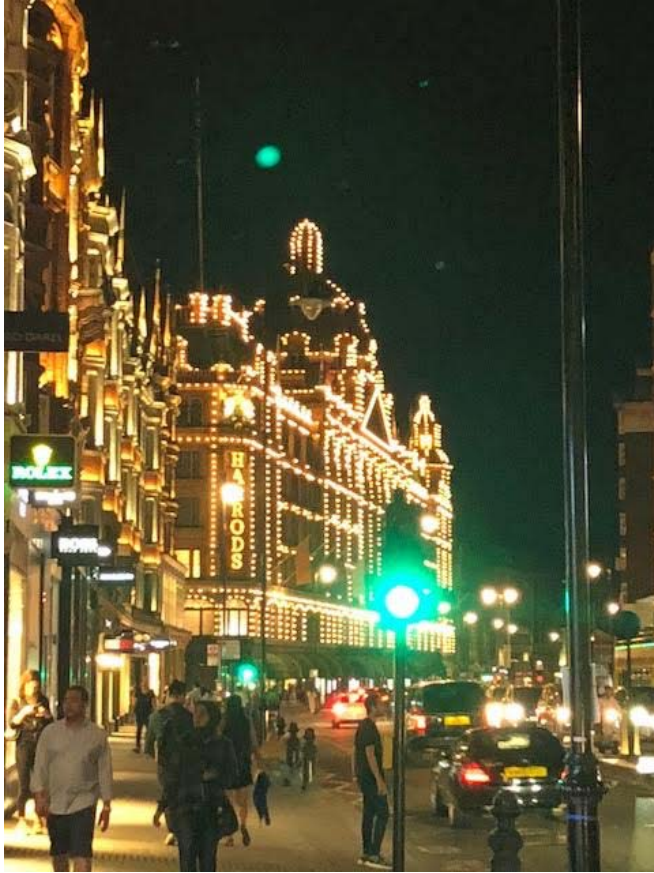
Harrods Department Store