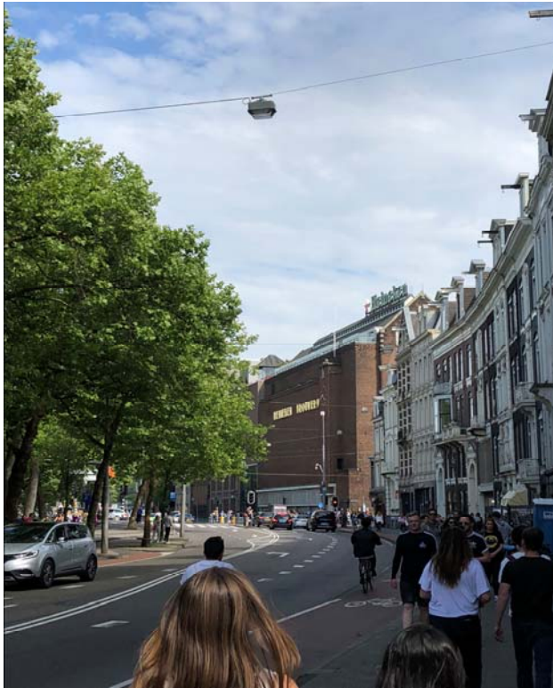
Heineken Brewery Museum