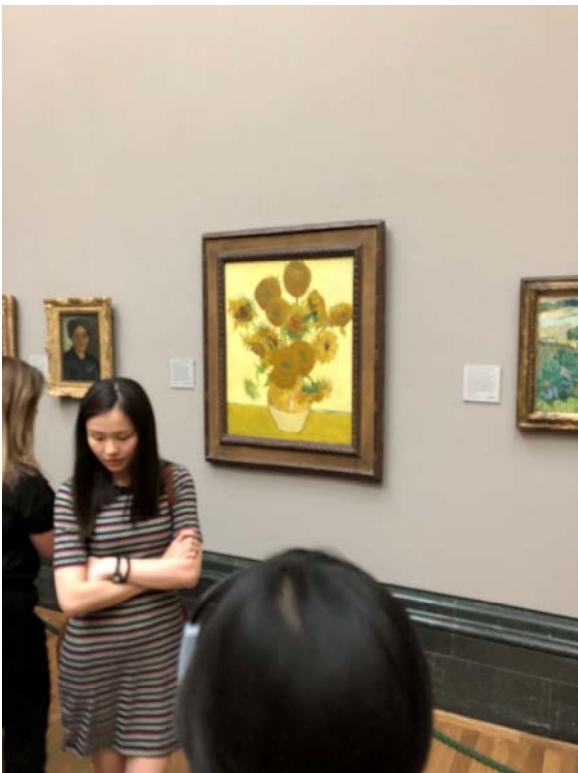
Van Gogh Sunflowers Painting (located in the National Gallery)